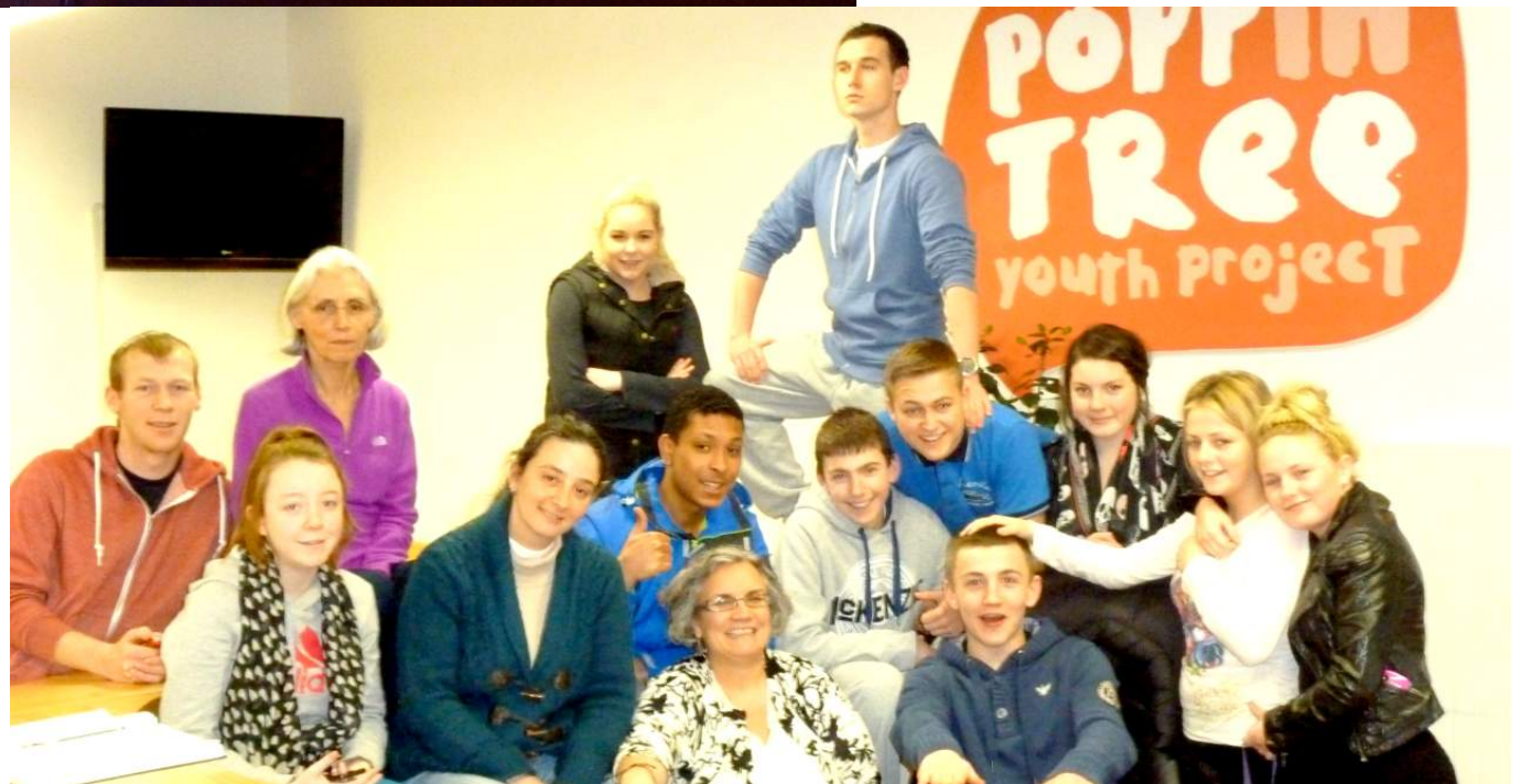
Workshop Extreme Poverty is Violence