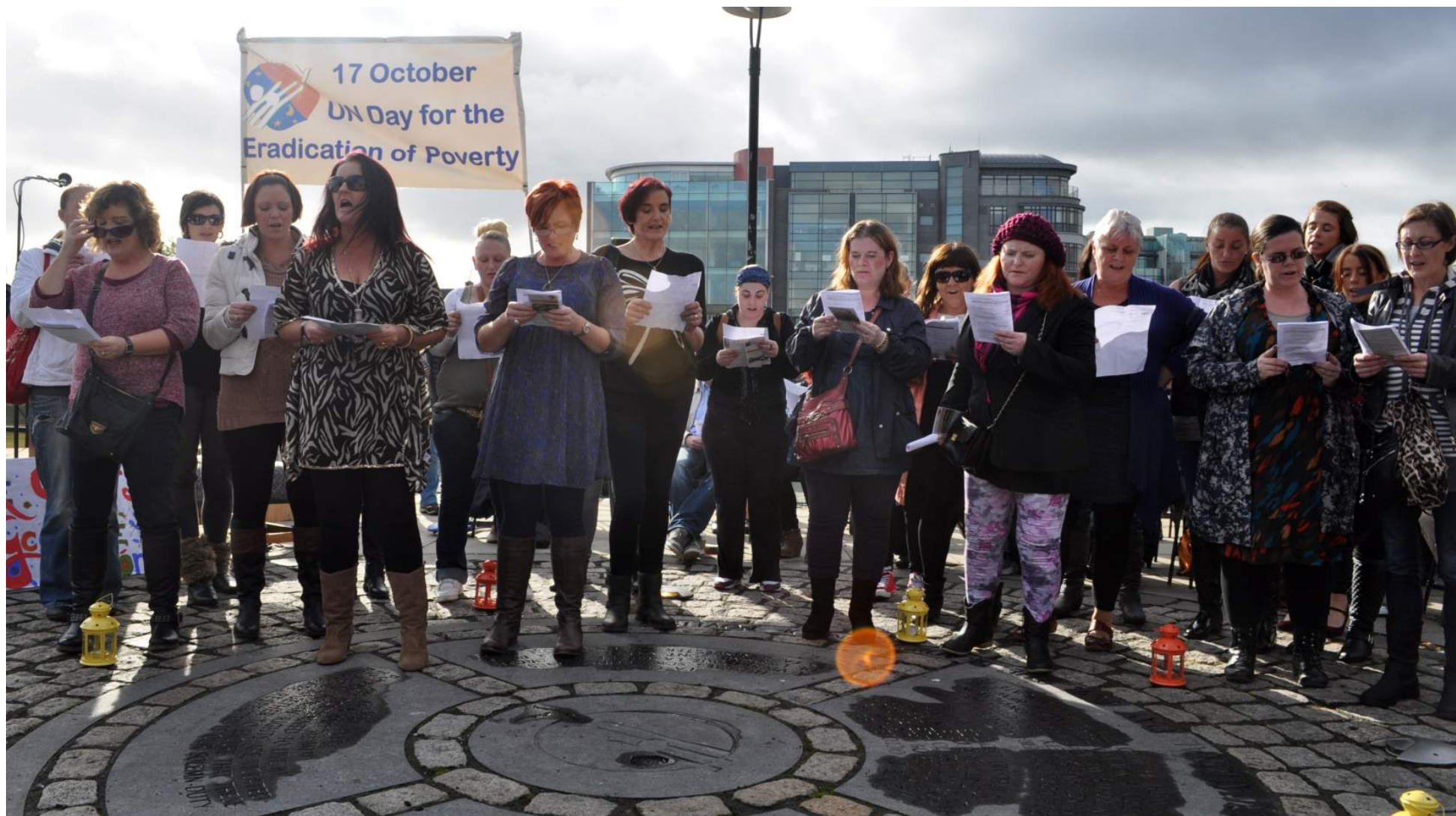
Women from the SAOL Project proclaiming the I bear witness to you Address on 17 October 2013