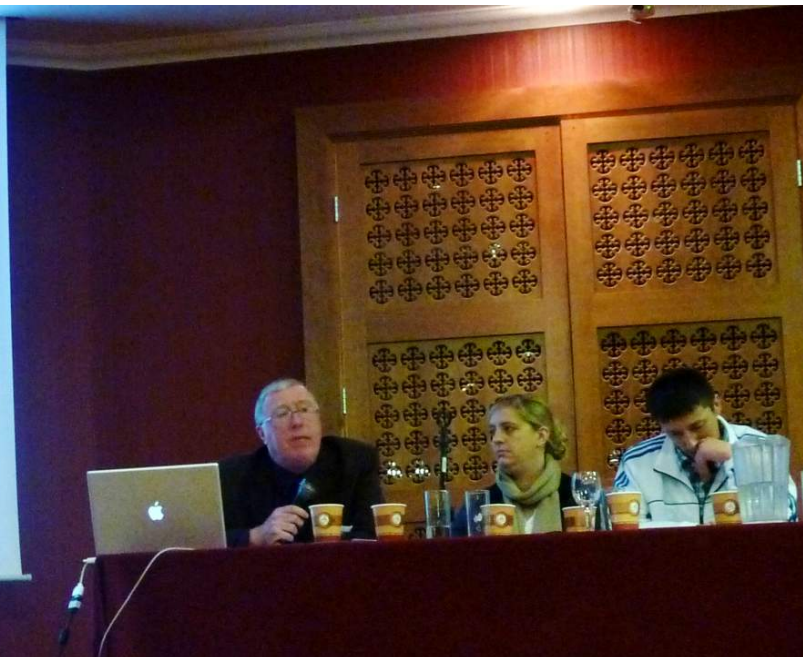
Ireland's hidden hunger scandal seminar